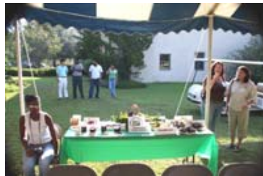
Jellies, jams and wine grape varieties including Carlos, Noble and Cynthiana.

members and volunteers. Again the children seem to have the most fun.