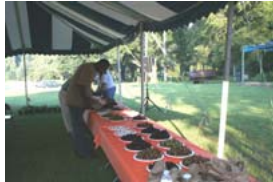
On the table are some of the many muscadine cultivars

In the after noon all were invited to stomp grapes. It reminded many people of the “I Love Lucy” show where Lucy was stomping grapes at a winery in Europe. Teams were formed consisting of faculty