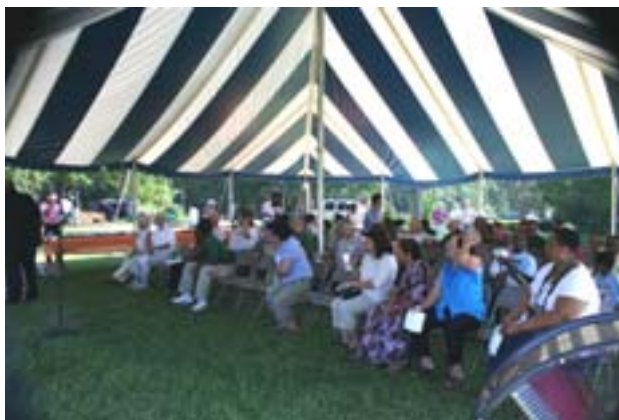
Shown is a very enthusiastic audience listening to the various speakers.